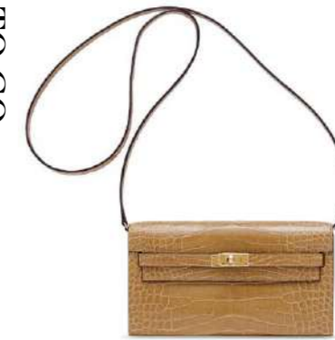
~#3809 A SHINY BEIGE SABLE ALLIGATOR KELLY TO GO WITH GOLD HARDWARE

GRADE: 1 HK$100,000-160,000 US$13,000-21,000