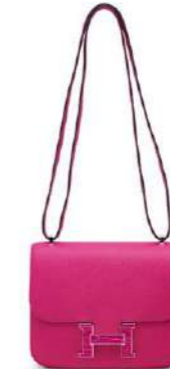
~#3808 A LIMITED EDITION ROSE MEXICO EPSOM LEATHER MINI CONSTANCE WITH SHINY ROSE MEXICO ALLIGATOR & PALLADIUM HARDWARE

GRADE: 1 HK$180,000-260,000 US$24,000-33,000