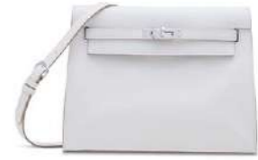
3852 A BÉTON EVERCOLOR LEATHER KELLY DANSE WITH PALLADIUM HARDWARE

GRADE: 1 HK$100,000-160,000 US$13,000-21,000