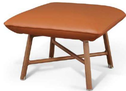
3964 A FAUVE TAURILLON H LEATHER & WALNUT WOOD LES NÉCESSAIRES D'HERMÈS "CARRÉ D'ASSISE" HIGH MODEL LOW STOOL

Grade: 1 HK$20,000-30,000 US$2,600-3,800