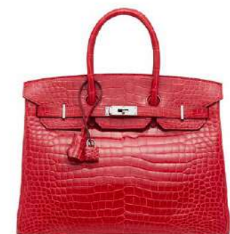
~#3923 A SHINY BOUGAINVILLIER POROSUS CROCODILE BIRKIN 35 WITH PALLADIUM HARDWARE

GRADE: 2.5 HK$140,000-200,000 US$18,000-26,000