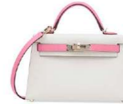
3850 A CUSTOM CRAIE & ROSE TEXAS EPSOM LEATHER MINI KELLY 20 II WITH PERMABRASS HARDWARE

GRADE: 1 HK$140,000-200,000 US$18,000-26,000