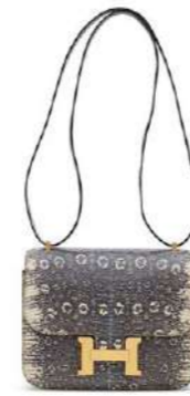
~#3840 A SHINY OMBRÉ SALVATOR LIZARD MINI CONSTANCE WITH GOLD HARDWARE

GRADE: 1 HK$180,000-260,000 US$24,000-33,000