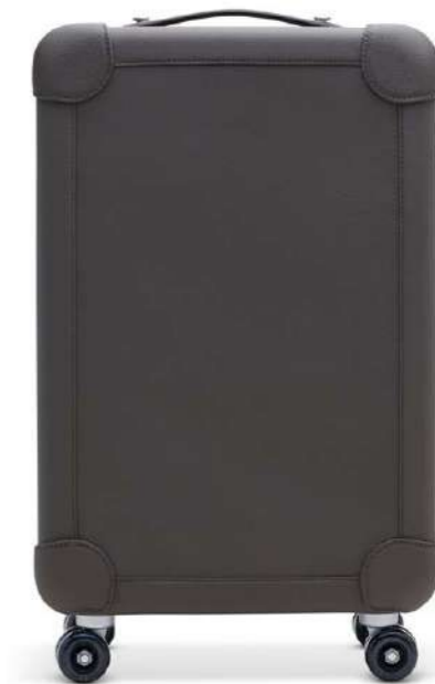
3916 AN ÉTAIN RÉGATE LEATHER R.M.S CABIN SUITCASE

GRADE: 2 HK$100,000-180,000 US$13,000-23,000