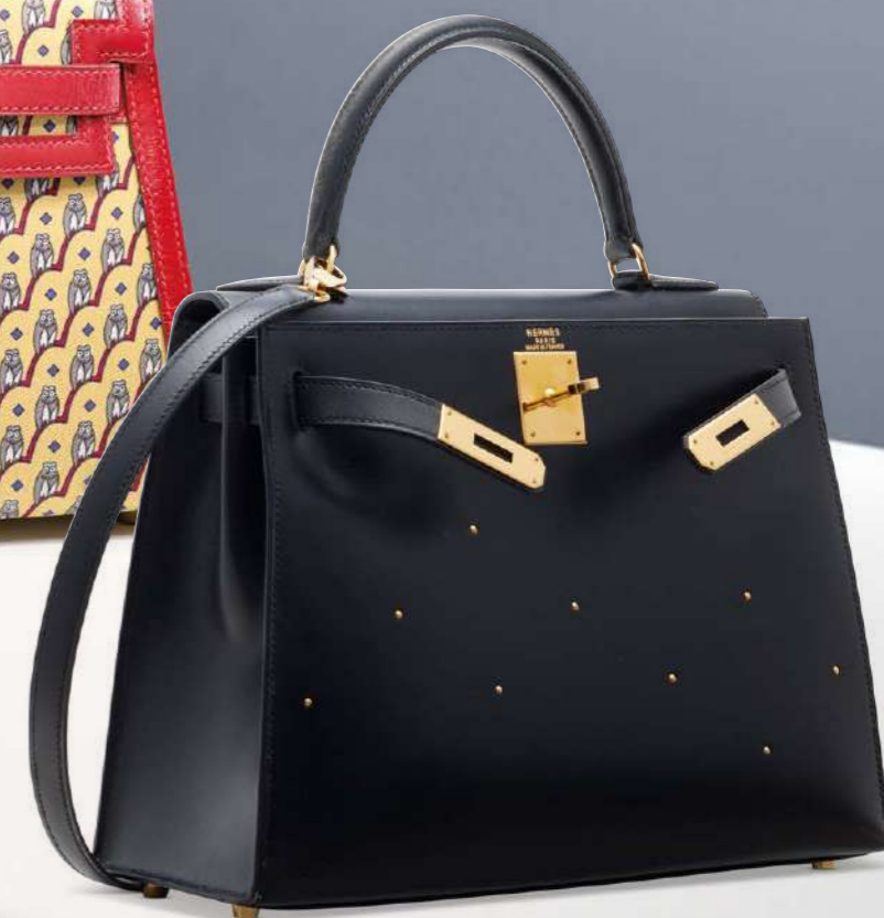
3882 A LIMITED EDITION BLACK CALF BOX LEATHER STUDS SELLIER KELLY 28 WITH GOLD HARDWARE HERMÈS, 1996 GRADE: 2.5 HK$120,000-180,000 US$16,000-23,000 28 w x 20 h x 10 d cm

While all Hermès handbags are rare, vintage pieces in perfect condition stand out with their distinctive allure, especially those discontinued models. Meanwhile, a well-preserved vintage bag also reaffirms Hermès' commitment to material selection and exceptional craftsmanship that can withstand the test of time. In this case, time becomes the best witness of the unparalleled savoir-faire embodied by a Hermès bag. Those who have ever seen and touched a Hermès handbag would agree that top-quality leathers selected against the most demanding criteria and the finest craftsmanship are the core values that make the house a timeless icon.