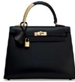
3877 A RARE & EXCEPTIONAL, 18K YELLOW GOLD & BLACK CALF BOX LEATHER SELLIER MIDAS KELLY 25 WITH 18K YELLOW GOLD HARDWARE

GRADE: 1 HK$160,000-240,000 US$21,000-31,000