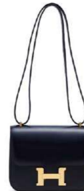
3883 A BLACK CALF BOX LEATHER MINI CONSTANCE WITH GOLD HARDWARE

GRADE: 1 HK$160,000-240,000 US$21,000-31,000