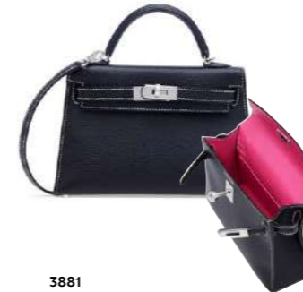
3881 A CUSTOM BLACK & ROSE MEXICO CHÈVRE LEATHER MINI KELLY 20 II WITH PALLADIUM HARDWARE

GRADE: 1 HK$200,000-280,000 US$26,000-36,000