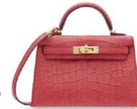
~#3922 A MATTE BOUGAINVILLIER ALLIGATOR MINI KELLY 20 II WITH GOLD HARDWARE

GRADE: 1 HK$140,000-200,000 US$18,000-26,000