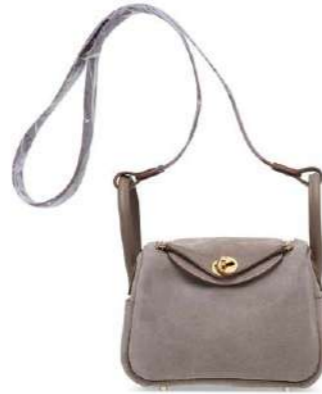
3842 A LIMITED EDITION GRIS CAILLOEU VEAU GRIZZLY & ÉTOUPE SWIFT LEATHER MINI LINDY WITH GOLD HARDWARE

GRADE: 1 HK$50,000-80,000 US$6,500-10,000