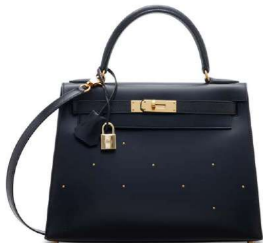
3882 A LIMITED EDITION BLACK CALF BOX LEATHER STUDS SELLIER KELLY 28 WITH GOLD HARDWARE HERMÈS, 1996 GRADE: 2.5 HK$120,000-180,000 US$16,000-23,000 28 w x 20 h x 10 d cm

The new Mini Kelly Clouté may be all the rage today, but its predecessor is little known even among seasoned Hermès collectors. The original Clouté Kellys were produced in the mid 1990's in a few sizes, and feature an asymmetric arrangement of nine small gold studs. This is the first time a 28cm example of the original Clouté Kelly has come to auction, a very exciting opportunity for collectors around the world!