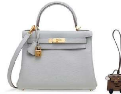
3835 A SET OF TWO: A GRIS PERLE TOGO LEATHER RETOURNÉ KELLY 28 WITH GOLD HARDWARE & AN ÉTOUPE TADELAKT LEATHER KELLY DOLL CHARM WITH GOLD HARDWARE

GRADE: 1 HK$80,000-120,000 US$11,000-15,000