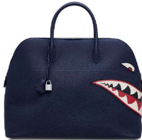
3947 A LIMITED EDITION BLEU NUIT TOGO LEATHER SHARK BOLIDE 45 WITH PALLADIUM HARDWARE

GRADE: 1.5 HK$60,000-100,000 US$7,700-13,000