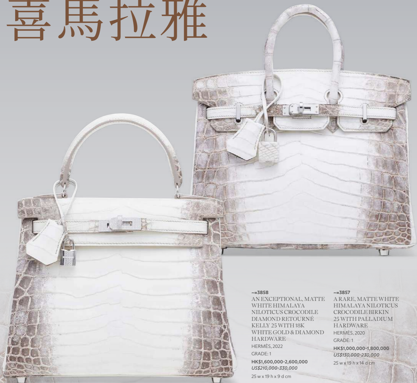
~#3858 AN EXCEPTIONAL, MATTE WHITE HIMALAYA NILOTICUS CROCODILE DIAMOND RETOURNÉ KELLY 25 WITH 18K WHITE GOLD & DIAMOND HARDWARE HERMÈS, 2022 GRADE: 1 HK$1,600,000-2,600,000 US$210,000-330,000 25 w x 19 h x 9 d cm