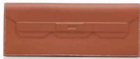
3821 A LIMITED EDITION GOLD SWIFT LEATHER SHADOW BIRKIN CUT HERMÈS, 2023 GRADE: 1 HK$50,000-80,000 US$6,500-10,000 29 w x 12.5 h x 3 d cm

Jean Paul Gaultier's tenure at Hermès, spanning from 2003 to 2010, marked a transformative period for the fashion house. His collaboration with Hermès brought a fresh perspective, blending his innovative design sensibilities with Hermès' timeless elegance. The Shadow Birkin Cut clutch is a testament to this collaboration, paying homage to the legendary Birkin bag while adding a unique and avant-garde twist. Featuring the iconic Birkin silhouette embossed in leather, the clutch creates a captivating play of light and shadow. Recently relaunched by Hermès, the Shadow Birkin Cut clutch continues to captivate fashion enthusiasts and collectors alike. Don't miss the opportunity to own such an iconic piece with the Shadow Birkin Cut clutch.