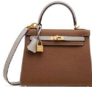
3828 A CUSTOM ALEZAN & GRIS TOURTERELLE RETOURNÉ KELLY 25 WITH BRUSHED GOLD HARDWARE

GRADE: 1 HK$240,000-320,000 US$31,000-41,000