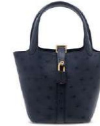
3946 A CABAN OSTRICH PICOTIN LOCK MICRO WITH GOLD HARDWARE

GRADE: 1.5 HK$60,000-100,000 US$7,700-13,000