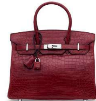
~#3931 A MATTE ROUGE H NILOTICUS CROCODILE BIRKIN 30 WITH PALLADIUM HARDWARE

GRADE: 1 HK$180,000-260,000 US$24,000-33,000