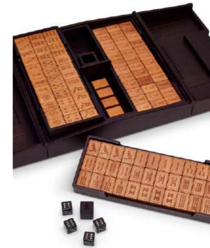
3969 A MAHOGANY MACAO MAHJONG GAME WITH ROUGE H EVERCOLOR & YELLOW NILOTICUS LIZARD BOX

Grade: 1 HK$70,000-110,000 US$9,000-14,000