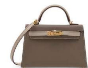
3844 A CUSTOM GRIS ASPHALTE & CRAIE EPSOM LEATHER MINI KELLY 20 II WITH GOLD HARDWARE

GRADE: 1 HK$400,000-500,000 US$52,000-64,000