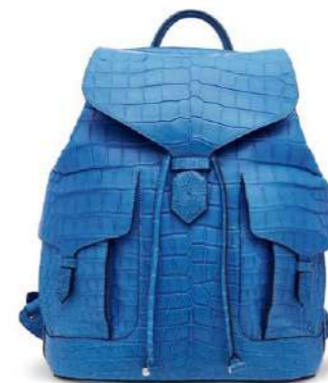
~#3948 A CUSTOM MATTE MYKONOS POROSUS CROCODILE BACKPACK WITH PALLADIUM HARDWARE

GRADE: 1.5 HK$70,000-110,000 US$9,000-14,000