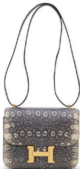
3840 A SHINY OMBRÉ SALVATOR LIZARD MINI CONSTANCE WITH GOLD HARDWARE HERMÈS, 2020 GRADE: 1 HK$180,000-260,000 US$24,000-33,000 18 w x 15 h x 5 d cm

Pieces from the Ombré Lizard collection are consistently desirable and sought after for collectors.