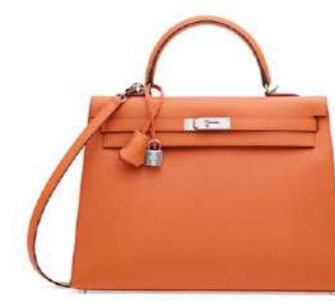
3917 A MANGUE EPSOM LEATHER SELLIER KELLY 35 WITH PALLADIUM HARDWARE

GRADE: 1 HK$80,000-120,000 US$11,000-15,000