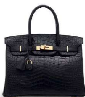
~#3887 A MATTE BLEU MARINE POROSUS CROCODILE BIRKIN 30 WITH GOLD HARDWARE

GRADE: 1 HK$120,000-180,000 US$16,000-23,000