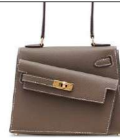
3911 A LIMITED EDITION ÉTOUPE EPSOM LEATHER MINI DÉSORDRE KELLY WITH GOLD HARDWARE

GRADE: 1 HK$160,000-240,000 US$21,000-31,000