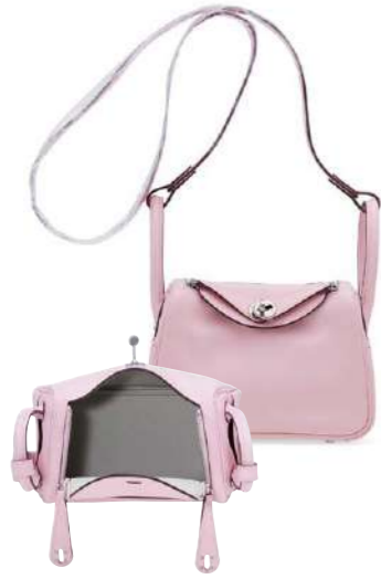
3802 A CUSTOM ROSE SAKURA & BÉTON SWIFT LEATHER MINI LINDY WITH PALLADIUM HARDWARE

GRADE: 1 HK$50,000-80,000 US$6,500-10,000