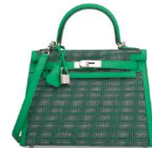
3904 A LIMITED EDITION TOILE QUADRILLE & MENTHE SWIFT LEATHER SELLIER KELLY 28 WITH PALLADIUM HARDWARE

GRADE: 1 HK$80,000-120,000 US$11,000-15,000