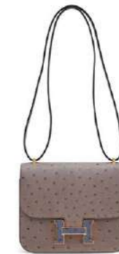
3841 A CUSTOM GRIS TOURTERELLE & GRIS AGATE OSTRICH MINI CONSTANCE WITH GOLD HARDWARE

GRADE: 1 HK$200,000-280,000 US$26,000-36,000