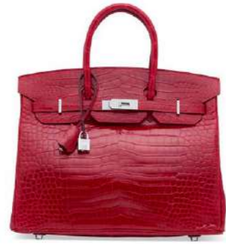
~#3928 AN EXCEPTIONAL, SHINY BRAISE POROSUS CROCODILE DIAMOND BIRKIN 35 WITH 18K WHITE GOLD & DIAMOND HARDWARE

GRADE: 1.5 HK$600,000-1,000,000 US$77,000-130,000