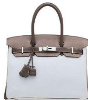
3847 A CUSTOM GRIS TOURTERELLE, ÉTOUPE & WHITE CLÉMENCE LEATHER BIRKIN 30 WITH PALLADIUM HARDWARE

GRADE: 2.5 HK$80,000-120,000 US$11,000-15,000