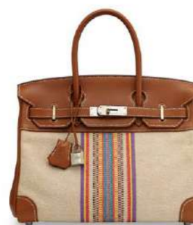
3824 A LIMITED EDITION FAUVE BARÉNIA & CANVAS GANGES BIRKIN 30 WITH PALLADIUM HARDWARE

GRADE: 1 HK$80,000-120,000 US$11,000-15,000