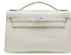
~#3853 A MATTE BÉTON ALLIGATOR LEATHER KELLY POCLETTE WITH PALLADIUM HARDWARE

GRADE: 1 HK$60,000-100,000 US$7,700-13,000