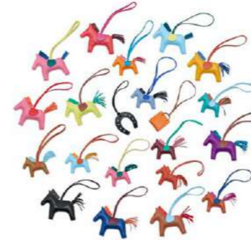
3898 A SET OF TWENTY ONE: RODÉO CHARMS, AN ORANGE SHOPPING BAG CHARM & A SADDLE CHARM

GRADE: 1 HK$50,000-80,000 US$6,500-10,000