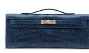
~#3938 A SHINY BLEU TEMPÊTE NILOTICUS CROCODILE KELLY CUT WITH PERMABRASS HARDWARE

GRADE: 2 HK$100,000-160,000 US$13,000-21,000