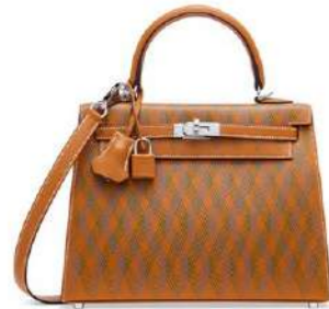
3816 A RARE, LIMITED EDITION NATUREL SABLE BUTLER LEATHER SELLIER LOSANGES KELLY 25 WITH PALLADIUM HARDWARE

GRADE: 1 HK$80,000-120,000 US$11,000-15,000