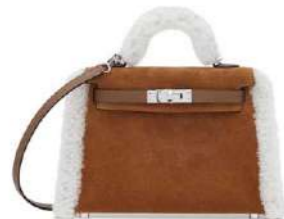
3826 A RARE, CHAMOIS VEAU GRIZZLY LEATHER, ALEZAN SWIFT LEATHER & ÉCRU SHEARLING MINI KELLY PLUCH 20 WITH PALLADIUM HARDWARE

GRADE: 1 HK$200,000-280,000 US$26,000-36,000