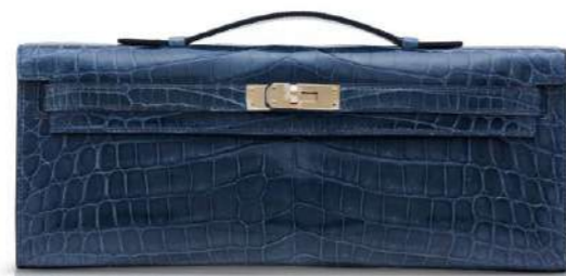
~#3938 A SHINY BLEU TEMPÊTE NILOTICUS CROCODILE KELLY CUT WITH PERMABRASS HARDWARE HERMÈS, 2014 GRADE: 1.5 HK$100,000-160,000 US$13,000-21,000 30 w x 13 h x 3 d cm

The new Mini Kelly Clouté may be all the rage today, but its predecessor is little known even among seasoned Hermès collectors. The original Clouté Kellys were produced in the mid 1990's in a few sizes, and feature an asymmetric arrangement of nine small gold studs. This is the first time a 28cm example of the original Clouté Kelly has come to auction, a very exciting opportunity for collectors around the world!