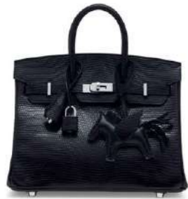
~#3879 A SET OF TWO: A SHINY BLACK NILOTICUS LIZARD BIRKIN 25 WITH PALLADIUM HARDWARE & A BLACK LIZARD TOUCH PEGASE LÓDÉO CHARM PM

GRADE: 1 HK$200,000-300,000 US$26,000-38,000