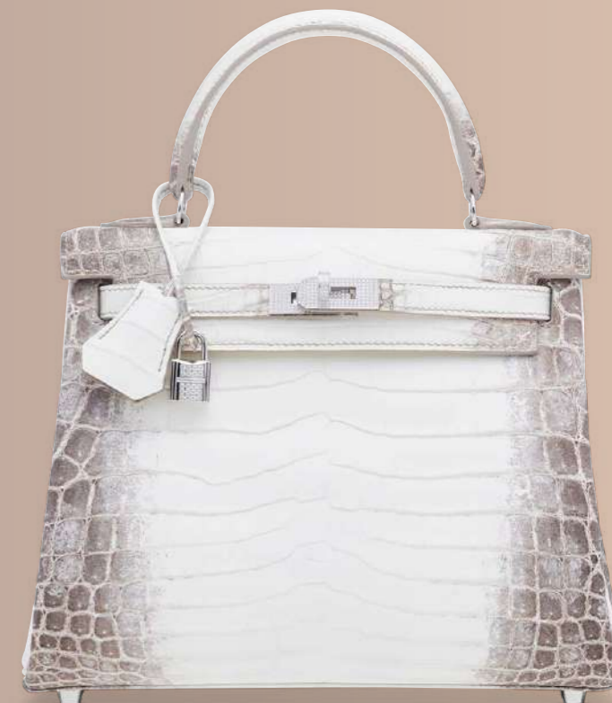
~#3858 AN EXCEPTIONAL, MATTE WHITE HIMALAYA NILOTICUS CROCODILE DIAMOND RETOURNÉ KELLY 25 WITH 18K WHITE GOLD & DIAMOND HARDWARE HERMÈS, 2022 GRADE: 1 HK$1,600,000-2,600,000 US$210,000-330,000 25 w x 19 h x 9 d cm

愛馬仕的鑽石手袋每只均精選完美無瑕的頂級皮料，由手藝精湛的工匠耗時漫長手工制作，產量稀缺，每只手袋均具備高度收藏價值。而當頂級且稀有的珍貴灣鱷抑或是喜馬拉雅鱷魚材質，鑲嵌以閃耀的高淨度鑽石與白金，令經典設計格外亮眼，引人駐足，更令原本就一件難求的愛馬仕手袋身價又再上一層樓。