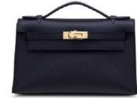
3868 A BLACK SWIFT LEATHER KELLY POCLETTE WITH GOLD HARDWARE

GRADE: 1 HK$160,000-240,000 US$21,000-31,000