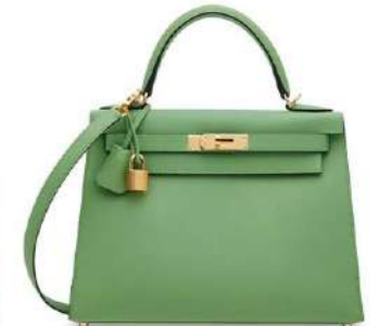
3906 A VERT CRIQUET EPSOM LEATHER SELLIER KELLY 28 WITH GOLD HARDWARE

GRADE: 1 HK$150,000-220,000 US$20,000-28,000