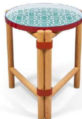
3967 A LES TROTTEUSES D'HERMÈS MEDIUM MODEL FOLDING OAK WOOD OCCASIONAL TABLE

Large: 40 w x 39 h cm Small: 34 w x 51 h cm