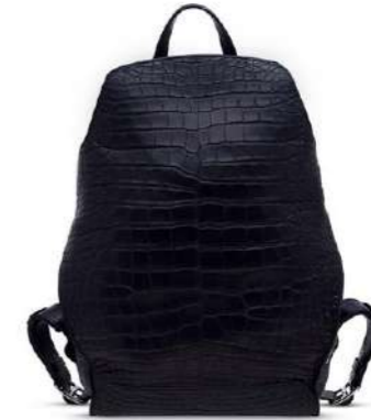
~#3896 A MATTE BLACK ALLIGATOR CITYBACK BACKPACK 27 WITH PALLADIUM HARDWARE

GRADE: 1 HK$50,000-80,000 US$6,500-10,000