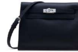
3871 A BLACK SWIFT LEATHER KELLY DANSE WITH PALLADIUM HARDWARE

GRADE: 1 HK$160,000-240,000 US$21,000-31,000