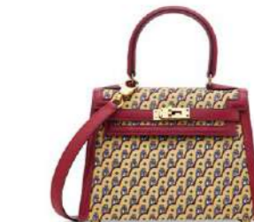
3925 A LIMITED EDITION ROUGE VIF BOX CALF LEATHER & OWL PRINT SILK SELLIER MINI KELLY 20 WITH GOLD HARDWARE

GRADE: 2 HK$240,000-320,000 US$31,000-41,000