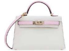
3865 A CUSTOM NATA & ROSE SAKURA CHÈVRE LEATHER MINI KELLY 20 II WITH PERMABRASS HARDWARE

GRADE: 1 HK$140,000-200,000 US$18,000-26,000