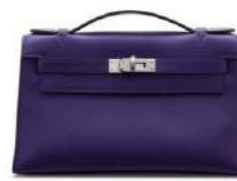
3935 AN IRIS SWIFT LEATHER KELLY POCLETTE WITH PALLADIUM HARDWARE

GRADE: 2 HK$80,000-120,000 US$11,000-15,000