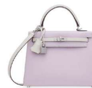
3805 A CUSTOM MAUVE PALE & NATA CHÈVRE LEATHER SELLIER KELLY 25 WITH BRUSHED PALLADIUM HARDWARE

GRADE: 1 HK$1,600,000-2,600,000 US$210,000-330,000