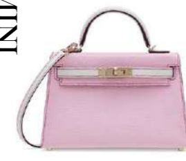
3803 A CUSTOM ROSE SAKURA & CRAIE CHÈVRE LEATHER MINI KELLY 20 II WITH PERMABRASS HARDWARE

GRADE: 1 HK$300,000-400,000 US$39,000-51,000