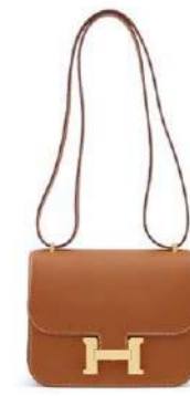
3820 A GOLD EPSOM LEATHER MINI CONSTANCE MIRROR WITH GOLD HARDWARE

GRADE: 1.5 HK$100,000-160,000 US$13,000-21,000