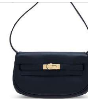
3869 A BLACK SWIFT LEATHER KELLY MOOVE WITH GOLD HARDWARE

GRADE: 1 HK$70,000-110,000 US$9,000-14,000