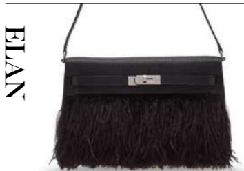
3873 A LIMITED EDITION BLACK CHÈVRE CHAMKILA LEATHER & FEATHERS KELLY ÉLAN FOLIE WITH PALLADIUM HARDWARE

GRADE: 1 HK$50,000-80,000 US$6,500-10,000