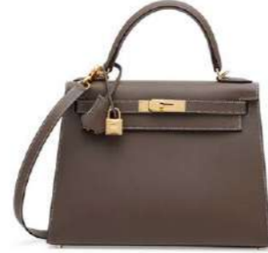
3912 AN ÉTOUPE EPSOM LEATHER SELLIER KELLY 25 WITH GOLD HARDWARE

GRADE: 1 HK$400,000-500,000 US$52,000-64,000