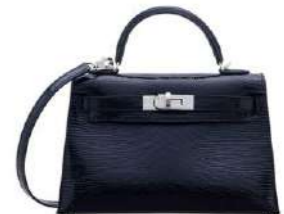
~#3880 A SHINY BLACK NILOTICUS LIZARD MINI KELLY 20 II WITH PALLADIUM HARDWARE

GRADE: 1 HK$350,000-450,000 US$45,000-58,000