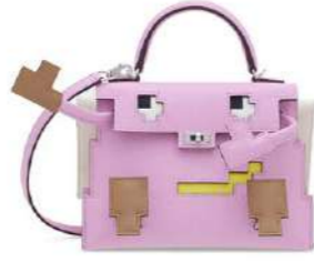
3806 A LIMITED EDITION MAUVE SYLVESTRE, CHAI LIME & NATA EPSOM LEATHER KELLYDOLE PICTO WITH PALLADIUM HARDWARE

GRADE: 1 HK$180,000-260,000 US$24,000-33,000