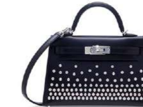
3874 A LIMITED EDITION BLACK CALF BOX LEATHER CLOUTÉ MINI KELLY 20 II WITH PALLADIUM HARDWARE

GRADE: 1 HK$400,000-500,000 US$52,000-64,000