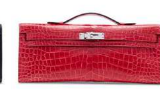
~#3921 A SHINY BOUGAINVILLIER POROSUS CROCODILE KELLY CUT WITH PALLADIUM HARDWARE

GRADE: 1.5 HK$400,000-500,000 US$52,000-64,000