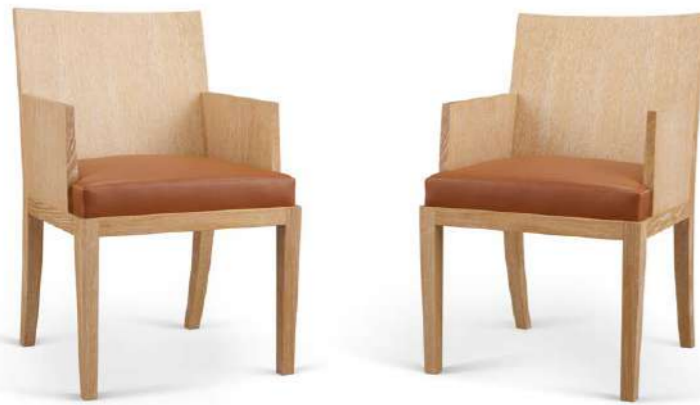
3963 A SET OF TWO JEAN-MICHEL FRANK REEDITION: GOLD TAURILLON H LEATHER & OAK WOOD ARMCHAIR

Grade: 1 HK$50,000-80,000 US$6,500-10,000