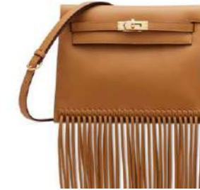
3814 A LIMITED EDITION SESAME SWIFT LEATHER KELLY DANSE ANATE WITH GOLD HARDWARE

GRADE: 1 HK$80,000-120,000 US$11,000-15,000