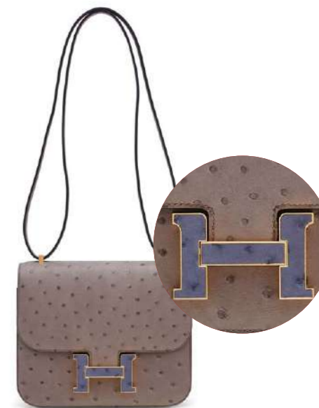
3841 A CUSTOM GRIS TOURTERELLE & GRIS AGATE OSTRICH MINI CONSTANCE WITH GOLD HARDWARE HERMÈS, 2022 GRADE: 1 HK$160,000-240,000 US$21,000-31,000 18 w x 15 h x 5 d cm

Christie's has auctioned off thousands of handbags, but this is the first time the company has ever offered a custom Ostrich Mini Constance. The custom-made item features a horseshoe stamp next to the Hermès logo inside the bag, and this small emblem has always increased the value. A custom bi-color Ostrich Mini Constance is really rare and difficult to source, so I'm thrilled to have this one up for Hong Kong handbags auction!