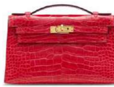
~#3920 A SHINY BOUGAINVILLIER ALLIGATOR KELLY POCLETTE WITH GOLD HARDWARE

GRADE: 1 HK$60,000-100,000 US$7,700-13,000