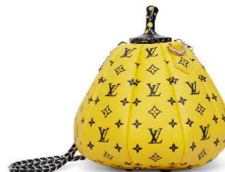
3952 A LIMITED EDITION YELLOW MONOGRAM PUMPKIN BAG WITH SILVER HARDWARE BY YAYOI KUSAMA LOUIS VUITTON, 2023 GRADE: 1 HK$70,000-110,000 US$9,000-14,000 18 w x 21 h x 18 d cm

The small and elongated version of the ever so classic Kelly exemplifies true elegance. The Kelly Cut has been available for over a decade and has become the quite popular over the past several years as collectors look to expand their Kelly collections. I adore the stunning combination of the shiny crocodile in Bleu Tempête with the hard to miss Permabrass hardware.