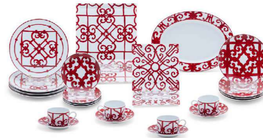
3970 A SET OF TWENTY FIVE: BALCON DU QUADALQUIVIR PORCELAIN SET

Grade: 1 HK$24,000-34,000 US$3,100-4,400