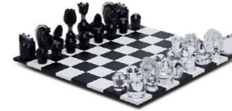
3968 A CRYSTAL CHESS SET BY SAINT LOUIS

Grade: 1 HK$16,000-24,000 US$2,100-3,100