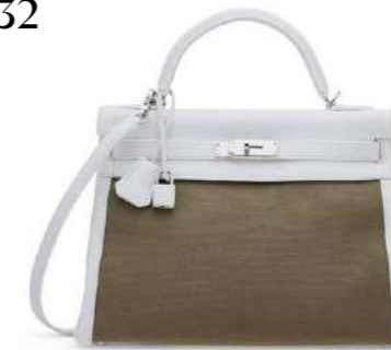
3848 A LIMITED EDITION WHITE EVERCALF LEATHER & CANVAS RETOURNÉ KELLY 32 WITH PALLADIUM HARDWARE

GRADE: 1.5 HK$60,000-100,000 US$7,700-13,000