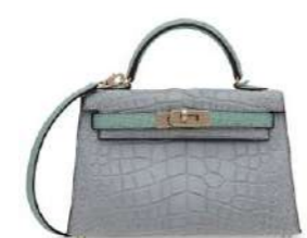
~#3834 A CUSTOM MATTE GRIS PERLE & VERT D'EAU ALLIGATOR MINI KELLY 20 II WITH PERMABRASS HARDWARE

GRADE: 1 HK$400,000-500,000 US$52,000-64,000