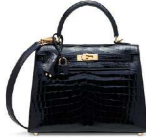
~#3878 A SHINY BLACK NILOTICUS CROCODILE SELLIER KELLY 25 WITH GOLD HARDWARE

GRADE: 1 HK$1,000,000-1,800,000 US$130,000-230,000