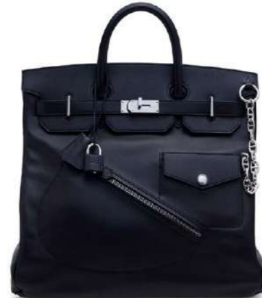
3894 A LIMITED EDITION BLACK EVERGRAIN LEATHER ROCK HAC BIRKIN 40 WITH PALLADIUM HARDWARE

GRADE: 1 HK$50,000-80,000 US$6,500-10,000