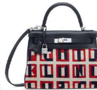
3889 A LIMITED EDITION LETTRES AU CARRÉ TOILE DE CAMP & BLACK SWIFT LEATHER RETOURNÉ KELLY 28 WITH PALLADIUM HARDWARE

GRADE: 2.5 HK$120,000-180,000 US$16,000-23,000