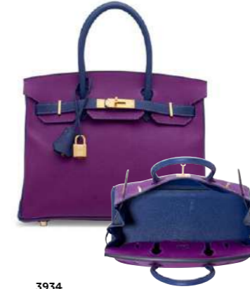
3934 A CUSTOM ANÉMONE & BLEU SAPHIR EPSOM LEATHER BIRKIN 30 WITH BRUSHED GOLD HARDWARE

GRADE: 1 HK$300,000-400,000 US$39,000-51,000