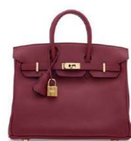
3932 A ROUGE VIF JONATHAN LEATHER BIRKIN 25 WITH GOLD HARDWARE

GRADE: 1 HK$120,000-180,000 US$16,000-23,000