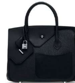
3893 A LIMITED EDITION BLACK TOGO & SWIFT LEATHER DÉSORDRE BIRKIN 30 WITH PALLADIUM HARDWARE

GRADE: 2 HK$160,000-240,000 US$21,000-31,000