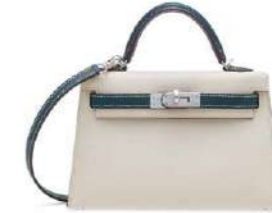
3851 A CUSTOM CRAIE & VERT CYPRÈS EPSOM LEATHER MINI KELLY 20 II WITH PALLADIUM HARDWARE

GRADE: 1 HK$140,000-200,000 US$18,000-26,000