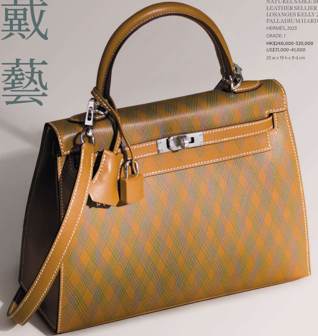
3816 A RARE, LIMITED EDITION NATUREL SABLE BUTLER LEATHER SELLIER LOSANGES KELLY 25 WITH PALLADIUM HARDWARE HERMÈS, 2023 GRADE: 1 HK$240,000-320,000 US$31,000-41,000 25 w x 19 h x 9 d cm