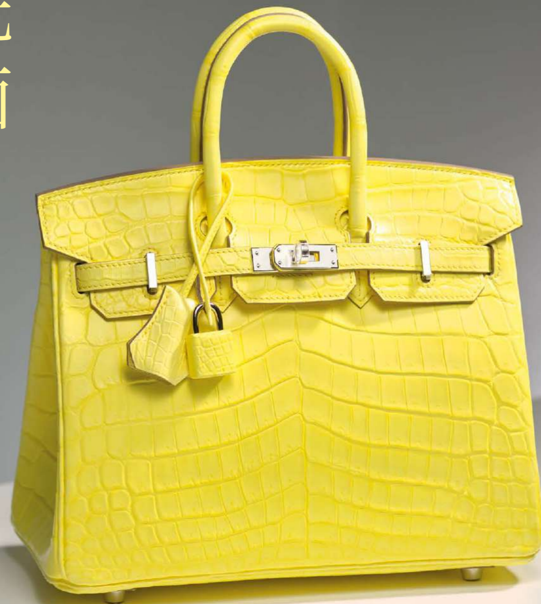
~#3831 A UNIQUE, MATTE BOREAL SATINE JAUNE CITRON NILOTICUS CROCODILE BIRKIN 25 WITH PALLADIUM HARDWARE HERMÈS, 2022 GRADE: 1 HK$400,000-500,000 US$52,000-64,000 25 w x 19 h x 14 d cm