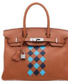
3819 A LIMITED EDITION GOLD SWIFT, BLEU DU NORD & BLEU INDIGO EPSOM LEATHER TRESSAGE BIRKIN 30 WITH PALLADIUM HARDWARE

GRADE: 2 HK$80,000-120,000 US$11,000-15,000