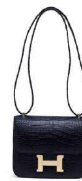
~#3884 A MATTE BLACK ALLIGATOR MINI CONSTANCE WITH GOLD HARDWARE

GRADE: 1 HK$70,000-110,000 US$9,000-14,000