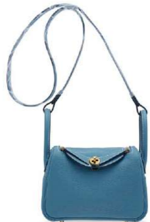
3945 A NEW BLEU JEAN TOGO LEATHER MINI LINDY WITH GOLD HARDWARE

GRADE: 1 HK$60,000-100,000 US$7,700-13,000