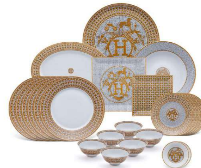
3971 A SET OF TWENTY FIVE: MOSAÏQUE AU 24 GOLD PORCELAIN SET

Grade: 1 HK$30,000-40,000 US$3,900-5,100