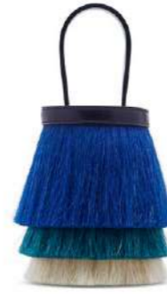
3942 A RARE, LIMITED EDITION BLEU THALASSA, VERT FONCÉ & NATA CRIN DE CHEVAL HORSEHAIR & BLACK EVERCALF LEATHER TOUPET 18 WITH PALLADIUM HARDWARE

GRADE: 1.5 HK$60,000-100,000 US$7,700-13,000