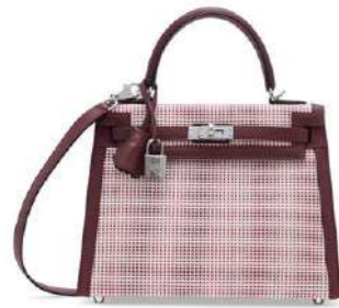
3930 A LIMITED EDITION ROUGE H SWIFT LEATHER & TOILE QUADRILLE SELLIER KELLY 25 WITH PALLADIUM HARDWARE

GRADE: 1 HK$350,000-450,000 US$45,000-58,000