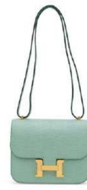
~#3900 A MATTE VERT D'EAU ALLIGATOR MINI CONSTANCE WITH GOLD HARDWARE

GRADE: 1 HK$200,000-280,000 US$26,000-36,000