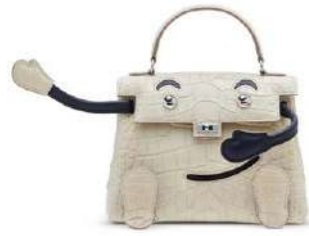
~#3855 A CUSTOM MATTE BÉTON ALLIGATOR & BLACK SWIFT LEATHER QUELLE IDOLE WITH PALLADIUM HARDWARE

GRADE: 1.5 HK$600,000-1,000,000 US$77,000-130,000