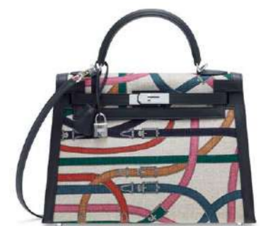
3890 A LIMITED EDITION TOILE DE CAMP CAVALCADOUR & BLACK SWIFT LEATHER SELLIER KELLY 32 WITH PALLADIUM HARDWARE

GRADE: 1.5 HK$60,000-100,000 US$7,700-13,000