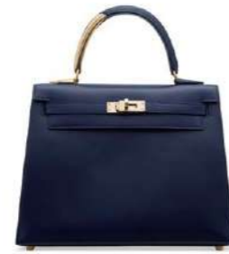
3937 A RARE & EXCEPTIONAL, 18K YELLOW GOLD AND BLEU SAPHIR CALF BOX LEATHER SELLIER MIDAS KELLY 25 WITH 18K YELLOW GOLD HARDWARE

GRADE: 1.5 HK$260,000-340,000 US$34,000-44,000