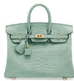
~#3901 A MATTE VERT D'EAU POROSUS CROCODILE BIRKIN 25 WITH GOLD HARDWARE

GRADE: 2 HK$140,000-200,000 US$18,000-26,000