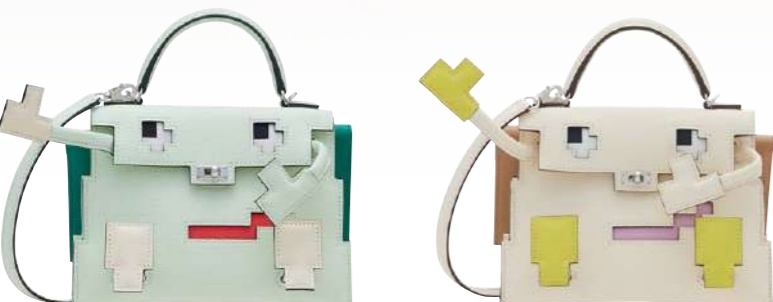
3902 A LIMITED EDITION VERT FIZZ, NATA, ROSE TEXAS & VERT JADE EPSOM LEATHER KELLYDOLE PICTO WITH PALLADIUM HARDWARE HERMÈS, 2023 GRADE: 1 HK$300,000-400,000 US$39,000-51,000 16.5 w x 11.5 h x 7 d cm