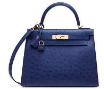
3941 A BLEU DE MALTE OSTRICH SELLIER KELLY 28 WITH GOLD HARDWARE

GRADE: 1.5 HK$70,000-110,000 US$9,000-14,000