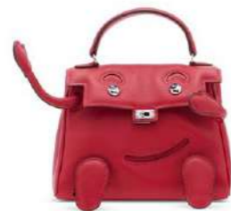
3924 A LIMITED EDITION VERMILLON SWIFT LEATHER QUELLE IDOLE WITH PALLADIUM HARDWARE, BELLAVITA TAIPEI 2009

GRADE: 1.5 HK$600,000-1,000,000 US$77,000-130,000