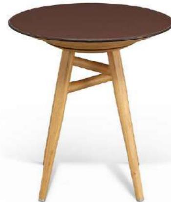
3965 A CHOCOLAT TAURILLON H LEATHER & OAK WOOD LES NÉCESSAIRES D'HERMÈS "TABLE À CACHETTE" STOOL TABLE

Grade: 1 HK$20,000-30,000 US$2,600-3,800