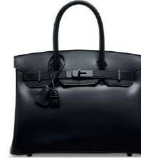
3892 A LIMITED EDITION CALF BOX LEATHER SO BLACK BIRKIN 30 WITH BLACK PVD HARDWARE

GRADE: 1.5 HK$80,000-120,000 US$11,000-15,000