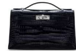
~#3875A A SHINY BLACK POROSUS CROCODILE KELLY POCLETTE WITH PALLADIUM HARDWARE

GRADE: 2 HK$120,000-180,000 US$16,000-23,000