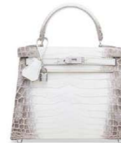
~#3858 AN EXCEPTIONAL, MATTE WHITE HIMALAYA NILOTICUS CROCODILE DIAMOND RETOURNÉ KELLY 25 WITH 18K WHITE GOLD & DIAMOND HARDWARE

GRADE: 1 HK$1,600,000-2,600,000 US$210,000-330,000