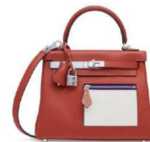
3829 A LIMITED EDITION CUIVRE, NATA, BLEU BRUME, CHAI & LIME SWIFT LEATHER COLORMATIC RETOURNÉ KELLY 25 WITH PALLADIUM HARDWARE

GRADE: 1 HK$80,000-120,000 US$11,000-15,000