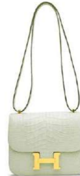
~#3839 A MATTE GRIS NÉVÉ ALLIGATOR MINI CONSTANCE WITH GOLD HARDWARE

GRADE: 1 HK$60,000-100,000 US$7,700-13,000