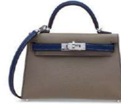
3845 A CUSTOM GRIS ASPHALTE & BLEU SAPHIR EPSOM LEATHER MINI KELLY 20 II WITH PALLADIUM HARDWARE

GRADE: 1 HK$140,000-200,000 US$18,000-26,000