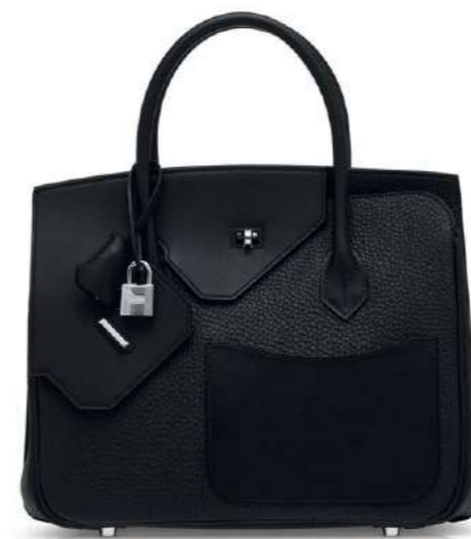
3893 A LIMITED EDITION BLACK TOGO & SWIFT LEATHER DESORDRE BIRKIN 30 WITH PALLADIUM HARDWARE HERMÈS, 2023 GRADE: 1 HK$180,000-260,000 US$24,000-33,000 30 w x 22 h x 15 d cm

The Birkin en Desordre, or the Birkin in Disorder, is the Birkin Bag, Remixed. This surrealist take on the classic design features an asymmetrical flap, a stitched exterior pocket, and just one 'pontent.' As if the Birkin was designed by Salvador Dalí or M.C. Escher, this surrealist, puzzle-style take on the Birkin features optical illusions from every angle. When viewed from the side, the Birkin is angled forward. This limited edition piece is a surprising and collectible limited edition for an art-lover.