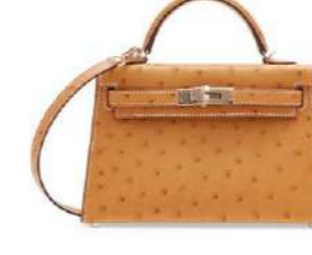
3818 A CUSTOM GOLD OSTRICH MINI KELLY 20 II WITH PERMABRASS HARDWARE

GRADE: 1 HK$100,000-160,000 US$13,000-21,000