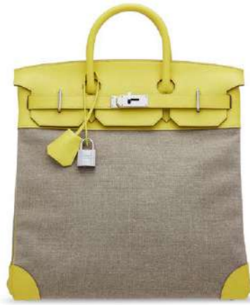
3832 A LIME EVERCOLOR LEATHER & FICELLE TOILE DE CAMP HAC BIRKIN 40 WITH PALLADIUM HARDWARE

GRADE: 1 HK$50,000-80,000 US$6,500-10,000