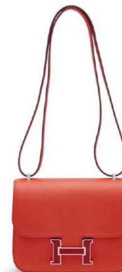
3919 A LIMITED EDITION CAPUCINE EPSOM LEATHER MINI CONSTANCE WITH SANGUINE ENAMEL HARDWARE HERMÈS, 2021 GRADE: 1 HK$70,000-110,000 US$9,000-14,000 18 w x 15 h x 5 d cm

The Louis Vuitton Pumpkin Kusama bag featuring Yayoi Kusama's playful pumpkin motif has set it apart from other designer bags. Its limited-edition status adds exclusivity and rarity, appealing to collectors and fashion enthusiasts alike. The artistic appeal of Kusama's collaboration with Louis Vuitton, combined with the brand's reputation for high quality craftsmanship and premium materials, ensures that the bag is not only stylish but also durable and long-lasting. As a coveted collector's item, the Louis Vuitton Pumpkin Kusama bag offers a blend of luxury, artistry, and exclusivity that makes it a desirable and sought-after piece in the fashion world.