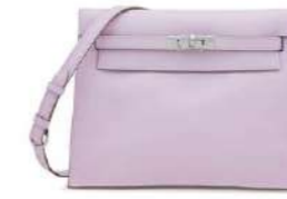
3804 A MAUVE PALE SWIFT LEATHER KELLY DANSE WITH PALLADIUM HARDWARE

GRADE: 1 HK$80,000-120,000 US$11,000-15,000