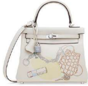
3864 A LIMITED EDITION NATA SWIFT LEATHER IN & OUT RETOURNÉ KELLY 25 WITH PALLADIUM HARDWARE

GRADE: 1 HK$160,000-240,000 US$21,000-31,000