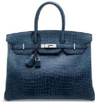
~#3939 A MATTE BLEU TEMPÊTE POROSUS CROCODILE BIRKIN 35 WITH PALLADIUM HARDWARE

GRADE: 1.5 HK$600,000-1,000,000 US$77,000-130,000