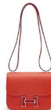
3919 A LIMITED EDITION CAPUCINE EPSOM LEATHER MINI CONSTANCE WITH SANGUINE ENAMEL HARDWARE

GRADE: 1 HK$160,000-240,000 US$21,000-31,000