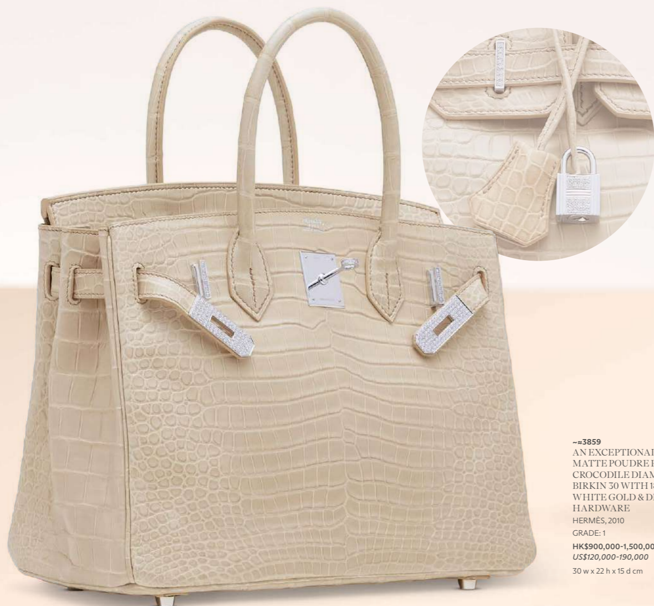
~#3859 AN EXCEPTIONAL, MATTE POUFRE POROSUS CROCODILE DIAMOND BIRKIN 30 WITH 18K WHITE GOLD & DIAMOND HARDWARE HERMÈS, 2010 GRADE: 1 HK$900,000-1,500,000 US$120,000-190,000 30 w x 22 h x 15 d cm

Each a true and rare collector's item, Hermès diamond handbags are hand-crafted using the finest and flawless leathers. It takes an expert artisan many hours to produce just one piece. The exceptional combination of the rarest and precious Porosus or Himalaya crocodile leather with top-quality diamonds and white gold hardware makes the timeless and coveted designs even more stunning and valuable.