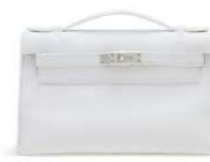
3849 A WHITE EVERCOLOR LEATHER KELLY POCLETTE WITH PALLADIUM HARDWARE

GRADE: 1 HK$60,000-100,000 US$7,700-13,000