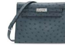
3908 A VERT AMANDE OSTRICH KELLY DANSE WITH PALLADIUM HARDWARE

GRADE: 1 HK$100,000-160,000 US$13,000-21,000