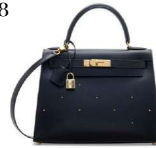
3882 A LIMITED EDITION BLACK CALF BOX LEATHER STUDS SELLIER KELLY 28 WITH GOLD HARDWARE

GRADE: 2.5 HK$120,000-180,000 US$16,000-23,000