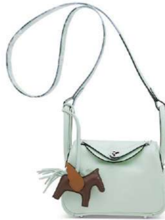
3899 A SET OF TWO: A VERT FIZZ SWIFT LEATHER MINI LINDY WITH PALLADIUM HARDWARE & A PEGASE RODÉO CHARM PM

GRADE: 1 HK$70,000-110,000 US$9,000-14,000