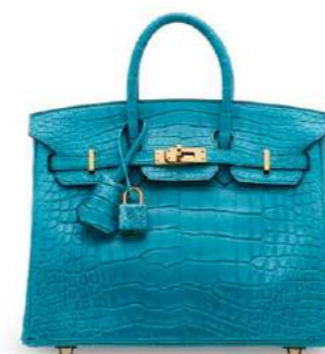
~#3949 A MATTE BLEU PAON ALLIGATOR BIRKIN 30 WITH GOLD HARDWARE

GRADE: 1.5 HK$350,000-450,000 US$45,000-58,000