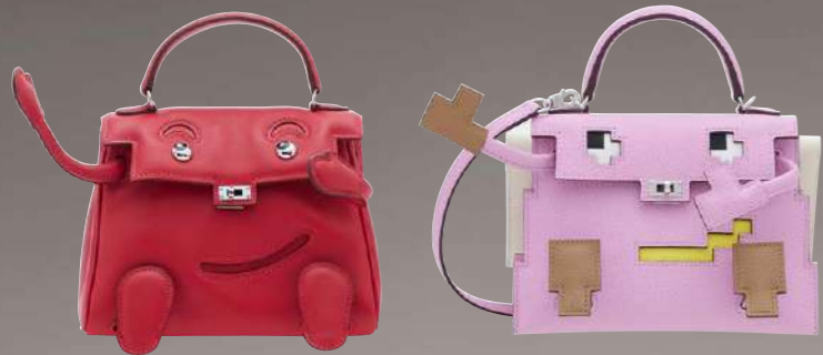
3924 A LIMITED EDITION VERMILLON SWIFT LEATHER QUELLE IDOLE WITH PALLADIUM HARDWARE, BELLAVITA TAIPEI 2009 HERMÈS, 2008 GRADE: 1 HK$180,000-260,000 US$24,000-33,000 15 w x 12 h x 6 d cm