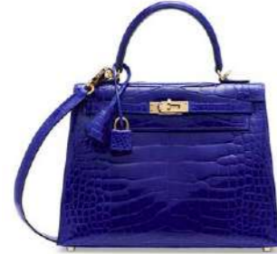
~#3936 A SHINY BLEU ÉLECTRIQUE ALLIGATOR SELLIER KELLY 25 WITH GOLD HARDWARE

GRADE: 1 HK$140,000-200,000 US$18,000-26,000