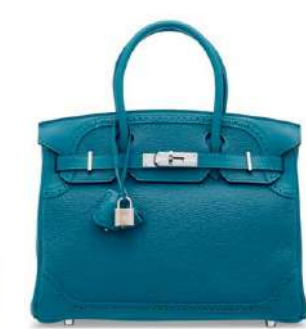
3943 A LIMITED EDITION TURQUOISE TOGO & SWIFT LEATHER GHILLIES BIRKIN 30 WITH PALLADIUM HARDWARE

GRADE: 2 HK$120,000-180,000 US$16,000-23,000