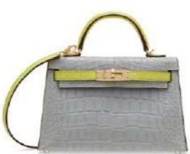
~#3833 A CUSTOM MATTE GRIS PERLE & LIME ALLIGATOR MINI KELLY 20 II WITH GOLD HARDWARE

GRADE: 1 HK$400,000-500,000 US$52,000-64,000