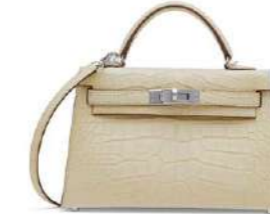
~#3867 A MATTE VANILLE ALLIGATOR MINI KELLY 20 II WITH PALLADIUM HARDWARE

GRADE: 1 HK$140,000-200,000 US$18,000-26,000