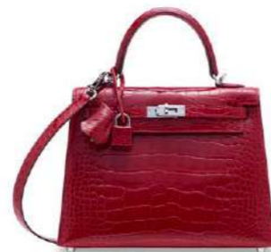
~#3927 A SHINY BRAISE ALLIGATOR SELLIER KELLY 25 WITH PALLADIUM HARDWARE

GRADE: 1 HK$100,000-160,000 US$13,000-21,000