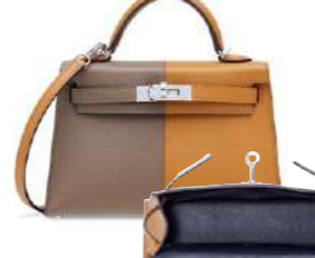
3813 A LIMITED EDITION SESAME, ÉTOUPE & BLEU INDIGO EPSOM MINI KELLY CASAQUE 20 II WITH PALLADIUM HARDWARE

GRADE: 1 HK$150,000-220,000 US$20,000-28,000