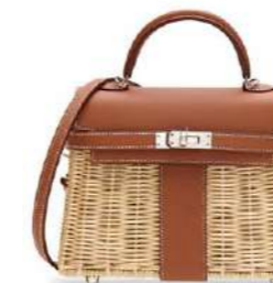
3822 A LIMITED EDITION GOLD SWIFT LEATHER & OSIER MINI PICNIC KELLY WITH PALLADIUM HARDWARE

GRADE: 1.5 HK$280,000-380,000 US$36,000-49,000