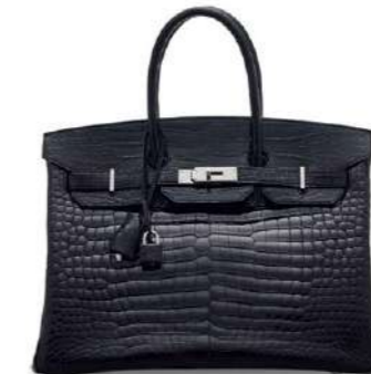
~#3888 A SHINY BLACK POROSUS CROCODILE BIRKIN 35 WITH PALLADIUM HARDWARE

GRADE: 2.5 HK$140,000-200,000 US$18,000-26,000