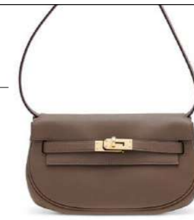
3910 AN ÉTOUPE SWIFT LEATHER KELLY MOOVE WITH GOLD HARDWARE

GRADE: 1 HK$70,000-110,000 US$9,000-14,000