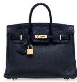
~#3886 A LIMITED EDITION MATTE BLACK ALLIGATOR & TOGO LEATHER TOUCH BIRKIN 25 WITH GOLD HARDWARE

GRADE: 1 HK$200,000-300,000 US$26,000-38,000