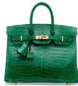
~#3907 A SHINY CACTUS POROSUS CROCODILE BIRKIN 25 WITH GOLD HARDWARE

GRADE: 1 HK$400,000-500,000 US$52,000-64,000