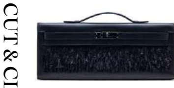
3876 AN EXCEPTIONAL, BLACK CALF BOX LEATHER FEATHERS SO BLACK KELLY CUT WITH BLACK PVD HARDWARE

GRADE: 1 HK$160,000-240,000 US$21,000-31,000