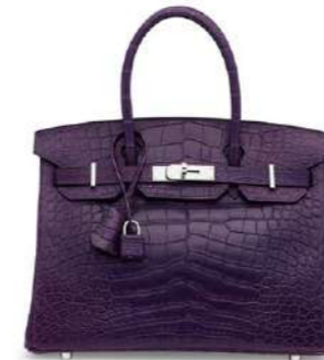
~#3933 A MATTE AMÉTHYSTE ALLIGATOR BIRKIN 30 WITH PALLADIUM HARDWARE

GRADE: 1 HK$900,000-1,500,000 US$120,000-190,000