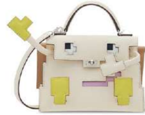
3863 A LIMITED EDITION NATA, MAUVE SYLVESTRE & LIME EPSOM LEATHER KELLYDOLE PICTO WITH PALLADIUM HARDWARE

GRADE: 1 HK$300,000-400,000 US$39,000-51,000