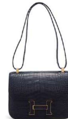
~#3885 A LIMITED EDITION MATTE BLACK ALLIGATOR CONSTANCE 24 WITH ALLIGATOR & GOLD HARDWARE

GRADE: 2 HK$150,000-220,000 US$20,000-28,000