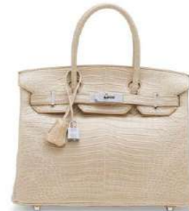
~#3859 AN EXCEPTIONAL, MATTE POUFRE POROSUS CROCODILE DIAMOND BIRKIN 30 WITH 18K WHITE GOLD & DIAMOND HARDWARE

GRADE: 1 HK$900,000-1,500,000 US$120,000-190,000