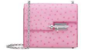
3801 A ROSE BUBBLEGUM OSTRICH MINI VERROU CHAÎNE WITH PALLADIUM HARDWARE

GRADE: 1 HK$60,000-100,000 US$7,700-13,000