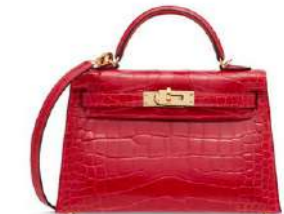
~#3926 A SHINY GÉRANIUM ALLIGATOR MINI KELLY 20 II WITH GOLD HARDWARE

GRADE: 2.5 HK$120,000-180,000 US$16,000-23,000