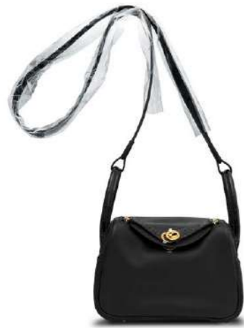
~#3870 A LIMITED EDITION MATTE BLACK ALLIGATOR & SWIFT LEATHER MINI LINDY TOUCH 19 WITH GOLD HARDWARE

GRADE: 1 HK$60,000-100,000 US$7,700-13,000