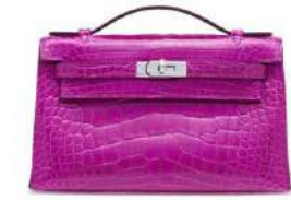
~#3807 A SHINY ROSE SCHÉHÉRAZADE ALLIGATOR LEATHER KELLY POCLETTE WITH PALLADIUM HARDWARE

GRADE: 1 HK$140,000-200,000 US$18,000-26,000