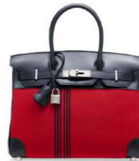
3891 A LIMITED EDITION BLACK CALF BOX LEATHER & RED CANVAS POTAMOS BIRKIN 30 WITH PALLADIUM HARDWARE

GRADE: 1.5 HK$80,000-120,000 US$11,000-15,000