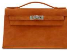
3918 AN ORANGE VEAU DOBLIS KELLY POCLETTE WITH PALLADIUM HARDWARE

GRADE: 1 HK$60,000-100,000 US$7,700-13,000