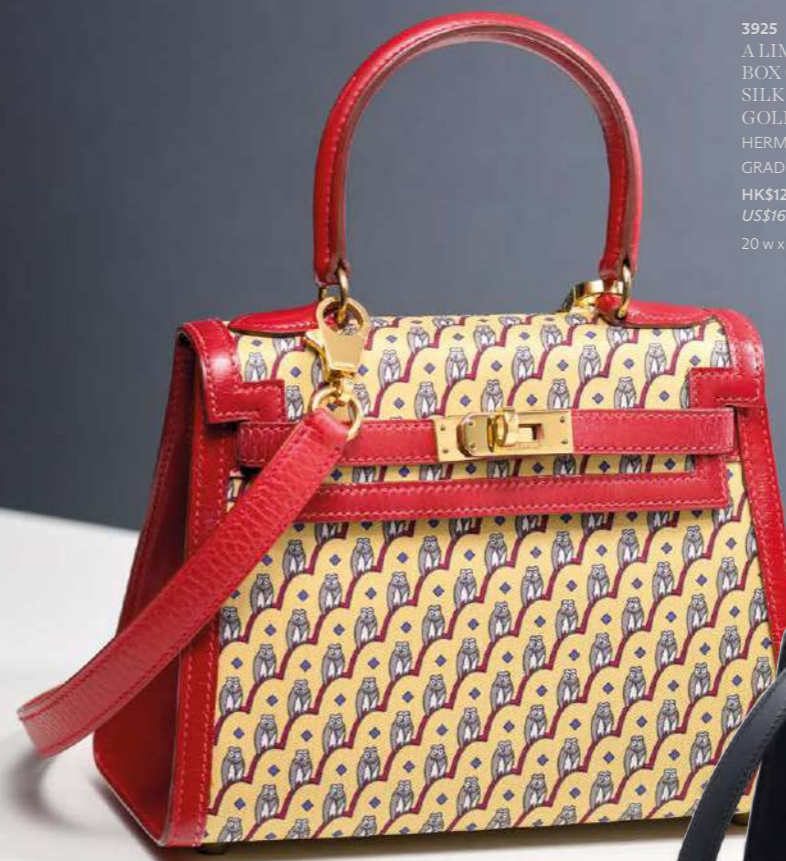
3925 A LIMITED EDITION ROUGE VIF BOX CALF LEATHER & OWL PRINT SILK SELLIER MINI KELLY 20 WITH GOLD HARDWARE HERMÈS, 1990 GRADE: 2.5 HK$120,000-180,000 US$16,000-23,000 20 w x 18 h x 14 d cm