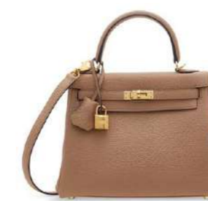
3812 A CHAI TOGO LEATHER RETOURNÉ KELLY 25 WITH GOLD HARDWARE

GRADE: 1 HK$140,000-200,000 US$18,000-26,000