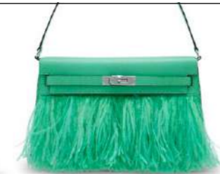
3903 A LIMITED EDITION VERT COMICS CHÈVRE CHAMKILA LEATHER & FEATHERS KELLY ÉLAN FOLIE WITH PALLADIUM HARDWARE

GRADE: 1 HK$200,000-280,000 US$26,000-36,000