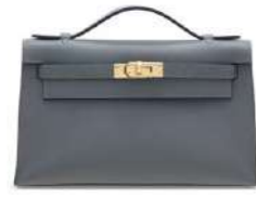
3846 A GRIS MEYER SWIFT LEATHER KELLY POCLETTE WITH GOLD HARDWARE

GRADE: 1 HK$140,000-200,000 US$18,000-26,000