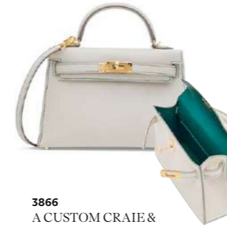
3866 A CUSTOM CRAIE & MALACHITE EPSOM LEATHER MINI KELLY 20 II WITH GOLD HARDWARE

GRADE: 1 HK$140,000-200,000 US$18,000-26,000