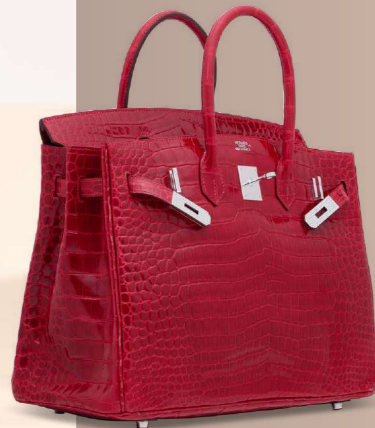
~#3928 AN EXCEPTIONAL, SHINY BRAISE POROSUS CROCODILE DIAMOND BIRKIN 35 WITH 18K WHITE GOLD & DIAMOND HARDWARE HERMÈS, 2008 GRADE: 1.5 HK$600,000-1,000,000 US$77,000-130,000 35 w x 25 h x 18 d cm