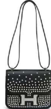
3875 A LIMITED EDITION BLACK CALF BOX LEATHER CLOUTÉ MINI CONSTANCE WITH PALLADIUM HARDWARE

GRADE: 1 HK$160,000-240,000 US$21,000-31,000