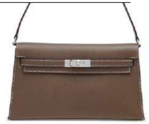
3909 AN ÉTOUPE MADAME LEATHER KELLY ÉLAN WITH PALLADIUM HARDWARE

GRADE: 1 HK$200,000-280,000 US$26,000-36,000