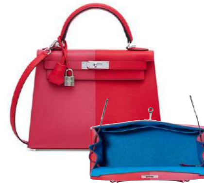
3929 A LIMITED EDITION ROUGE DE COEUR, ROSE EXTRÊME & BLEU ZANZIBAR SELLIER KELLY CASAQUE 28 WITH PALLADIUM HARDWARE

GRADE: 1 HK$120,000-180,000 US$16,000-23,000