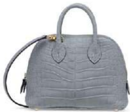
~#3837 A MATTE GRIS CIMENT ALLIGATOR MINI BOLIDE WITH GOLD HARDWARE

GRADE: 1 HK$160,000-240,000 US$21,000-31,000