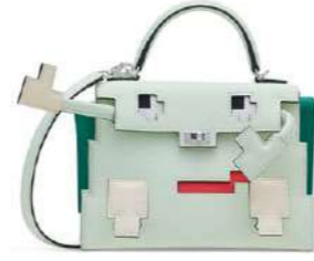
3902 A LIMITED EDITION VERT FIZZ, NATA, ROSE TEXAS & VERT JADE EPSOM LEATHER KELLYDOLE PICTO WITH PALLADIUM HARDWARE

GRADE: 1 HK$300,000-400,000 US$39,000-51,000