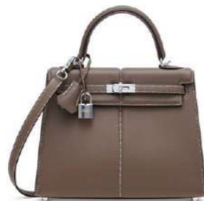
3913 A LIMITED EDITION ÉTOUPE SWIFT LEATHER SELLIER PADDED KELLY 25 WITH PALLADIUM HARDWARE

GRADE: 1 HK$120,000-180,000 US$16,000-23,000