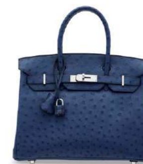
3940 A BLEU ROI OSTRICH BIRKIN 30 WITH PALLADIUM HARDWARE

GRADE: 1.5 HK$100,000-160,000 US$13,000-21,000