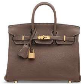
3914 AN ÉTOUPE TOGO LEATHER BIRKIN 25 WITH GOLD HARDWARE

GRADE: 1 HK$200,000-280,000 US$34,000-44,000