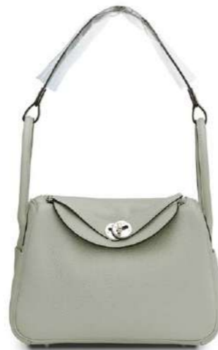
~#3843 A LIMITED EDITION GRIS NÉVÉ CLÉMENCE LEATHER & MATTE GRIS PERLE NILOTICUS CROCODILE TOUCH LINDY 26 WITH PALLADIUM HARDWARE

GRADE: 1 HK$80,000-120,000 US$11,000-15,000