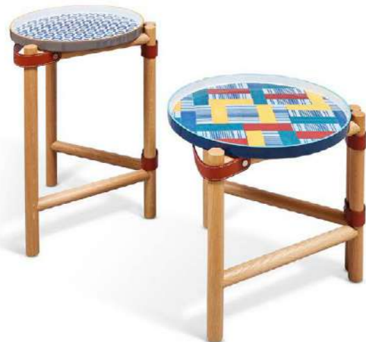
3966 A SET OF TWO LES TROTTEUSES D'HERMÈS LARGE & SMALL MODEL FOLDING OAK WOOD OCCASIONAL TABLE

Big square plate x 2: 27 w x 27 h cm Small square plate x 2: 19.5 w x 19.5 h cm Oval platter: 29 w x 59 cm Round dinner plate x 4: diameter 27.5 cm Round dessert plate x 4: diameter 21.5 cm Small round plate x 4: diameter 16 cm Tea cup x 4 and saucer x 4: Capacity: 16 cl